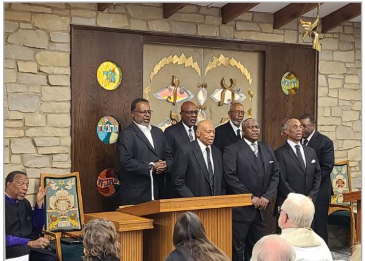
Second Baptist Church Male Chorus