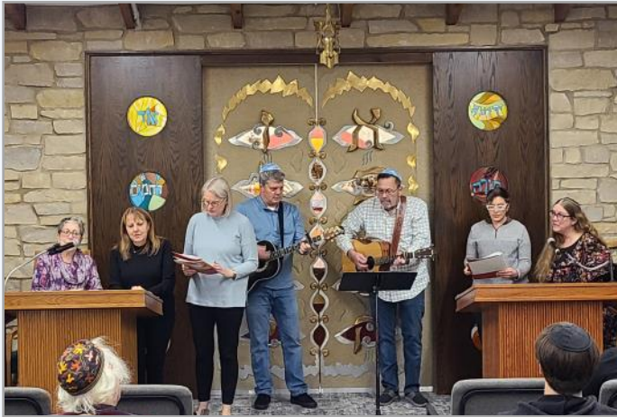
"Shir Delight" - Congregation Beth Israel Choir